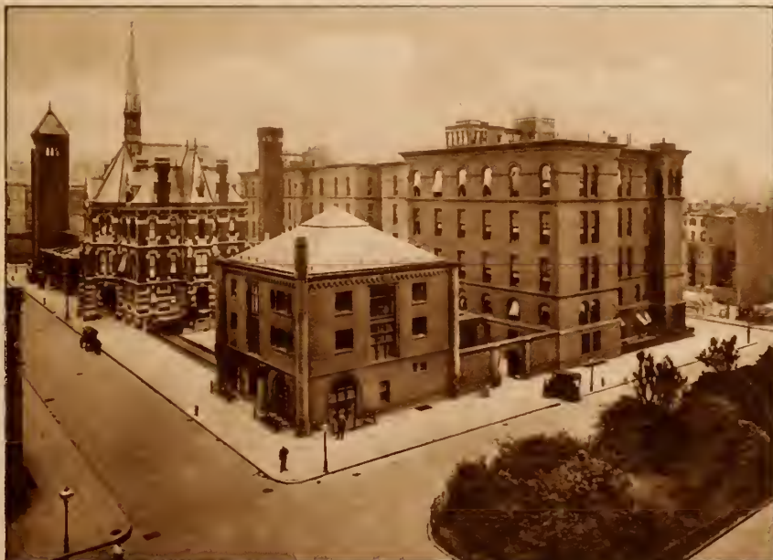
PRESBYTERIAN HOSPITAL, at 70th Street and Madison Avenue.